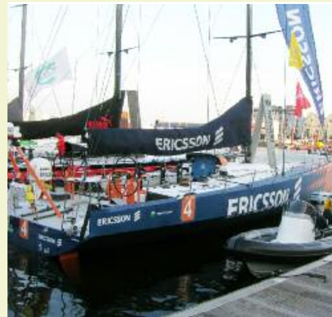
Ericson 4 moored in Galway Harbour.

Both teams had taken very different roads in the lead in to the competition. For Galway it was months of training in Athenry with 7 League Games of which they won 4. For Ericson 4 it was months of training in Lanzarote and 7 legs of the Volvo Round the World yacht race of which they also won 4. Galway were just 2 days away from the start