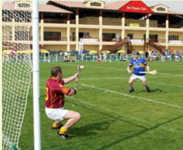
Photos show some of the action from the Annual Dubai Duty Free Gulf Gaelic Games.